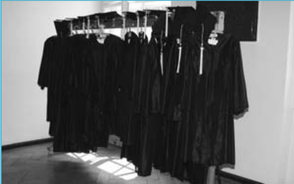
The robes awaiting the students.