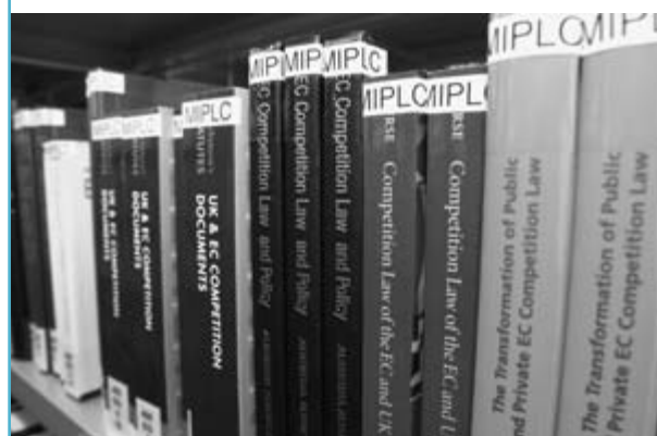
The MIPLC textbook library.