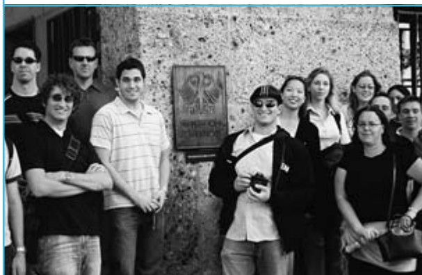
GW Summer Program students visiting the German Patent and Trademark Office.