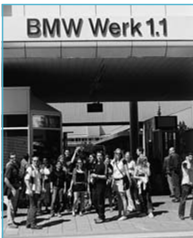
GW Summer Program and MIPLC students visiting BMW.

In July, the George Washington University Law School successfully ran for the first time a four-week intellectual property summer program at the MIPLC. Four of the six courses offered in the program were also part of the MIPLC IP LL.M. program curriculum. Thirty-one students came to Munich for the program: twenty-seven from law schools across the United States, and four from other countries. The program also featured talks by Max Planck Institute researchers and visits to the German Patent and Trademark Office, the European Patent Office, BMW, and a local IP law firm. GW Law plans to hold the program on an annual basis.