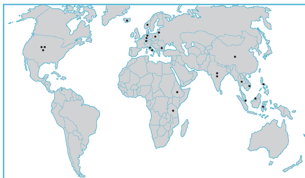
Map showing the students' countries of origin.